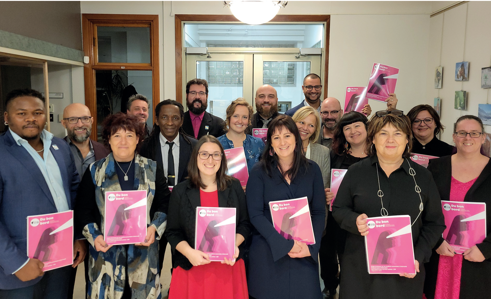
The members of the FSSS-CSN negotiation committee with the sector deposit.

The Common Front submitted its demands to the government on October 28. Hundreds of workers were on hand to show the government that we speak with one voice and are committed to our demands.